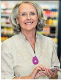
GPS Mobile Above