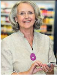
GPS Mobile Above