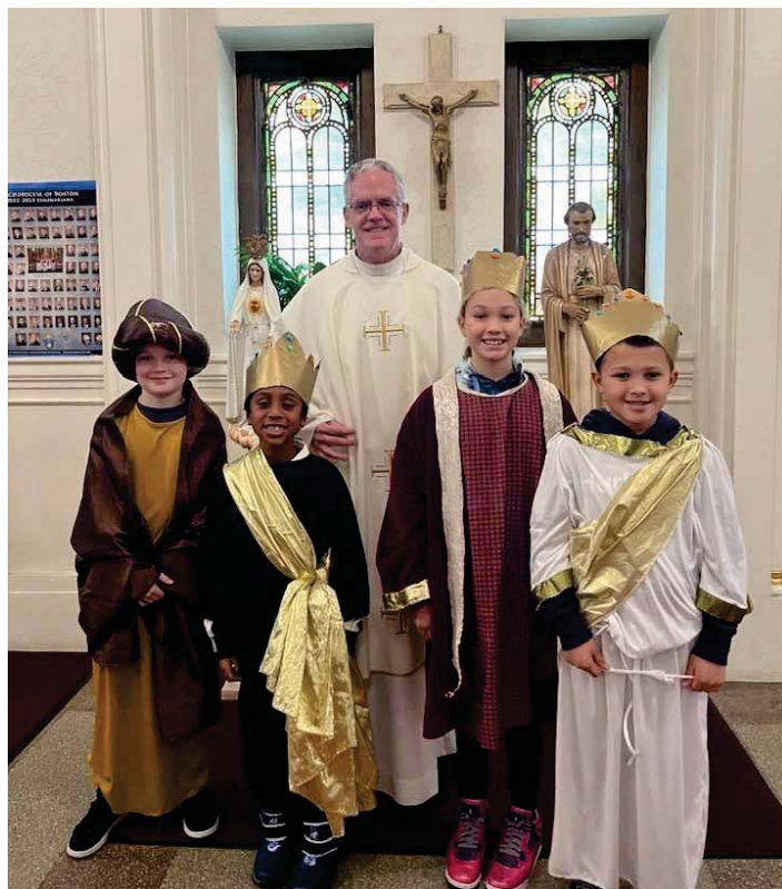
The 3 Kings (plus one) stopped to visit us in Medford on their way back from Bethlehem.

Please call the parish office at 781-396-0423 x 103 to donate or for more information.